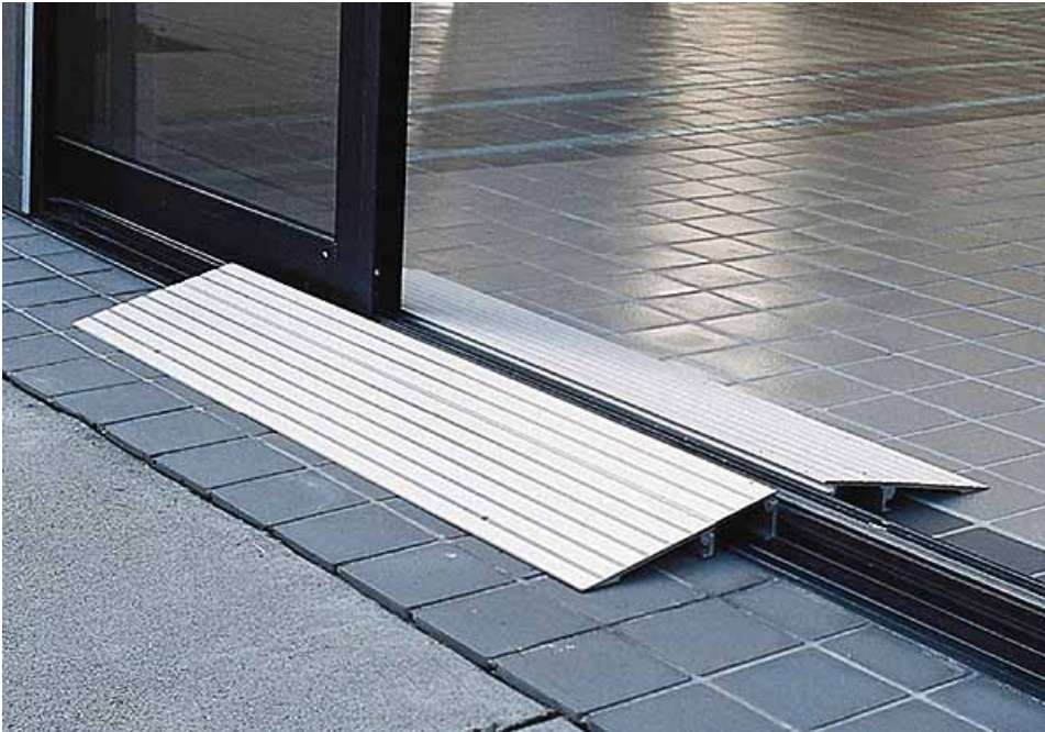
Ideal for sliding doors (two ramps shown)

The EZ-ACCESS® Threshold ramp is a lightweight yet durable free-standing modular ramp designed for doorways, sliding glass doors and raised landings. This seam-free ramp is 34" wide and easily accommodates thresholds from ¾" to 6" high. Ideal for use with wheelchairs, walkers, and cane users. Made of anodized aluminum and is intended for indoor or outdoor use.