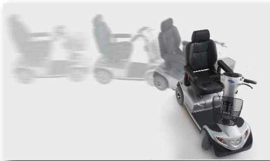
Speed Reduction Technology Automatically slows down the scooter around bends and corners.